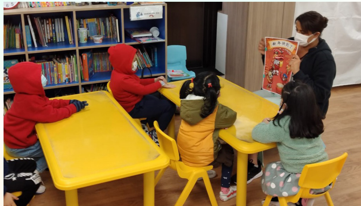
Original picture books with diverse real-life themes and captivating story plots are closely related to NCS children’s life experiences and culture.

Special thanks to the “Start from the Beginning: Chinese Supporting Scheme for Non-Chinese Speaking Students in Kindergartens” (HKU) team for providing teaching and learning resources to our Chinese Classes. All these materials are designed to cater for cultural diversity and individual differences. Well received lots of positive feedback from parents and kindergarten teachers, that the children start to speak up Chinese or sing Chinese songs naturally.