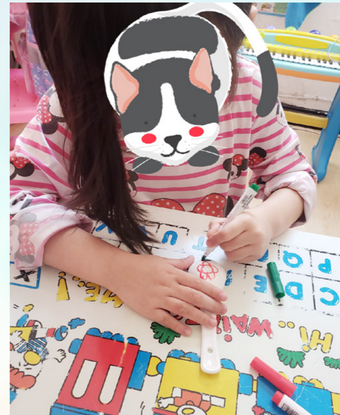
Here are some photos shared by some parents when playing “Make Magic At Home”.