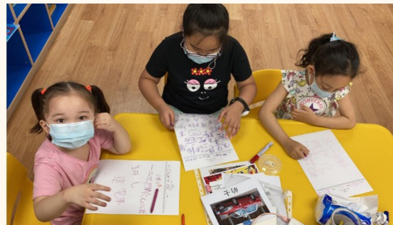
Component-based character teaching realia helps NCS children master common components of Chinese characters in a systematic way and develop Chinese literacy skills and learning strategies.

All Cantonese songs were written to match the melody to the linguistic tones of the lyrics. Singing easy-to-follow nursery rhymes, together with language activities, are fun ways to boost the development of NCS children’s language skills.