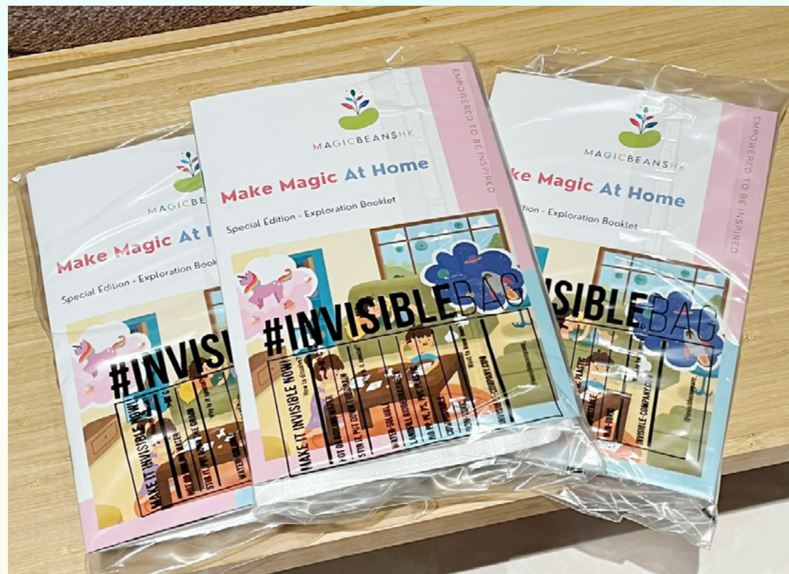
Many thanks to Magic Beans HK for providing “Make Magic At Home”