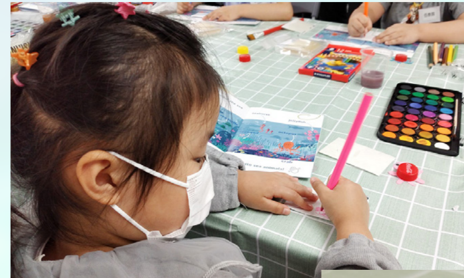
The children's finished the little turtle so cute.

The event had been held successfully on 21 May. Thank you for all the participants and volunteers.